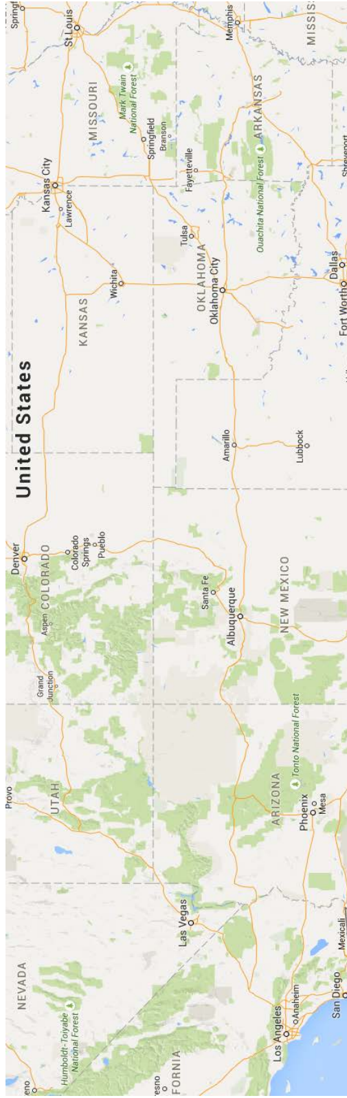
Figure 1. How would you get from St. Louis to Los Angeles in 2015?