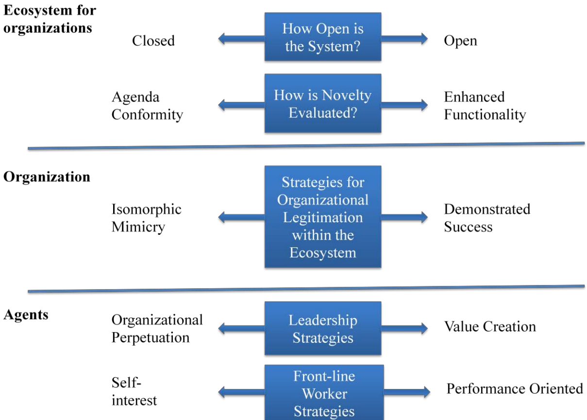
Figure 1. Tensions playing out at different levels of engagement in development